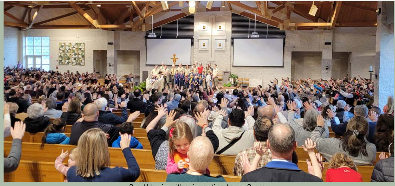
Scout blessing with active participation on Sunday

A click away 🔐 If you are receiving a paper copy, visit the parish website at www.stfrancisraleigh.org.