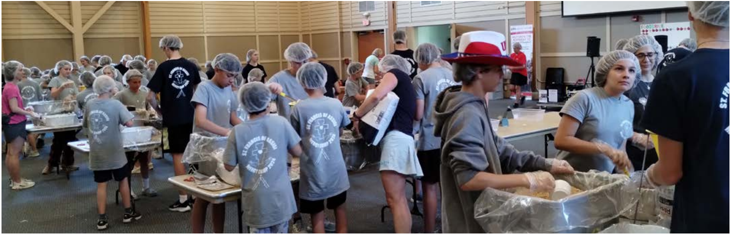
Mercy Camp participants prepare food packages.