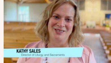
Click to view - 1 min.